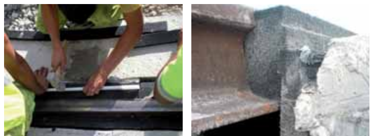
Figure 2 : Unlocking of jacket, rail removal, rail re-insertion and track operation.