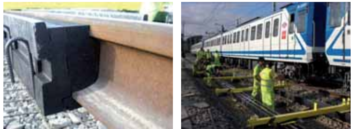
Figure 1 : Jacketing of rail, positioning of rails before concreting, finished REMS track.

The installation of 54 meter of test track in Madrid is the initial part of the validation process of REMS. Practical installation issues, speed of execution and rail replacement were tested, preparing the larger scale validation foreseen in the Metro de Madrid network during the second half of the Urbantrack project.