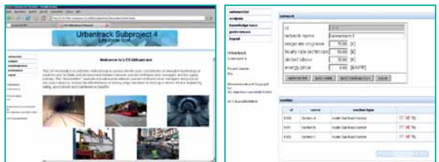
Figure 1: Screen shots of software tool LCC-UrbanTrack ( www.urbantrack-sp4.eu )

After significant efforts for the development of the LCC model, Urban Track's SP 4 Team has finalised the specification of the software tool and the software tool itself, which is a web-based solution easily accessible to partners across Europe and the world. Initial ideas had been discussed in-depth with European operators and within the Urban Track consortium. A first LCC calculation workshop has been held in Frankfurt in June 2008 where the partners from Sub Projects 1 and 2, in particular, were taught how to feed their data into the software and how to calculate their LCC. First calculations have then been carried out, especially by Sub Project 1 in time for the last reporting period in August 2008. Obviously, this tool could also be of interest to other operators across Europe wanting to carry out some comparative LCC calcu-