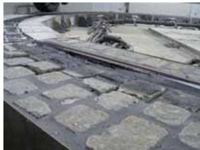
Figure 2: Displacements on test bodies 7 and 8 at 30°C during the first cycle

At STUVA's facility, various tests were carried out simulating the load exerted on track surfaces by buses and lorries over a period of ten years. A total of 16 different track types were tested: eight with a firm carriageway surface and eight with a 'green' one capable of being driven over in an emergency (six with granulate for sedum and two with artificial turf on top of concrete bodies).